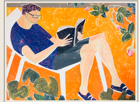
Man Reading , by Kazhia Kolb